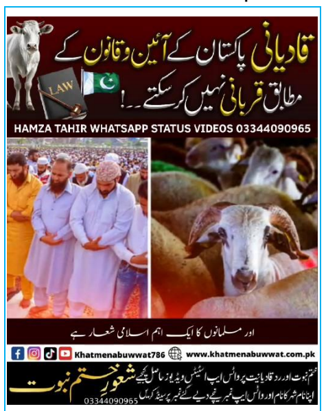
Screenshot of the social media video in Pakistan, which threatens Ahmadis for imprisonment for praying and celebrating the Islamic Eid traditions.

According to the latest information IHRC has received, at least six Ahmadi Muslims have been arrested and five First Information Reports (FIRs) have been registered in Punjab, Pakistan against Ahmadi Muslims for sacrificing animals on Eid-ul-Adha. All the FIRs are registered un-der Section 298-C of the Pakistan Penal Code (PPC). Two of the cases have been registered at the Saddar Gojra police station in Toba Tek Singh. There has been one registered at each of the